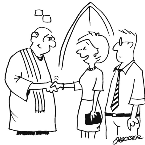
"The heart-shaped communion wafers were a nice touch for Valentine's Day."